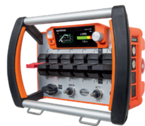
Version with linear levers.

These useful features can be conveniently activated at the touch of a button.