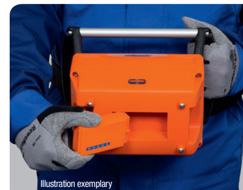
High-performing Li-ion exchange batteries, optional with capacity gauge.