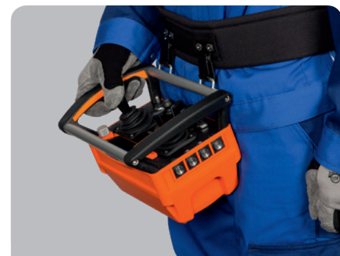
Carrying with the hip belt.