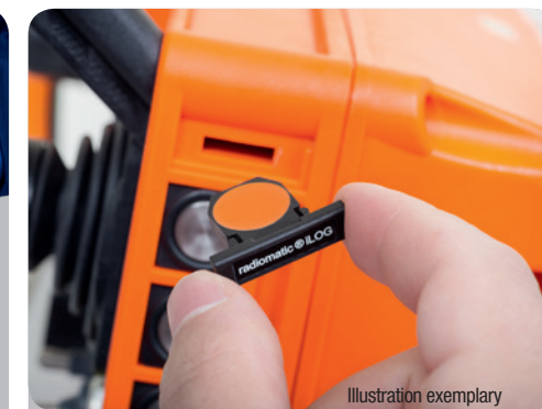
radiomatic® iLOG for the quick activation of a spare transmitter.